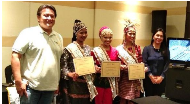
On a Wednesday Noon...Spouses' Day with the Hiyas sa Kadayawan 2019 & her court. Sept. 11, 2019 at Marco Polo Hotel